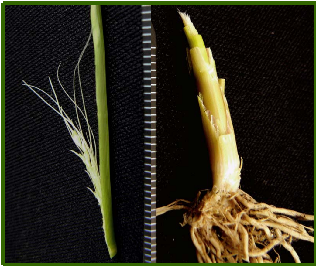
Figure 1: Dissection of two newly initiated panicles of O. meridionalis (Keep River accession). Panicles were enclosed in many layers of leaves that had been peeled away. Each division represents 1 mm.