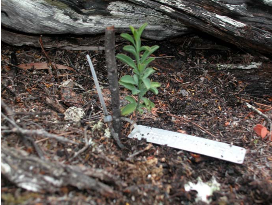
Fig. 3. Young leafy shoot of the Freycinet Wax Flower at Mount Mayson, resprouting off an older stem.

The plants are generally spindly, consisting of a main stem and are often sparingly branched. The population included young plants, 4 cm in height, through to large, well established plants that were up to 90 cm in height. Resprouting from older stems that had been damaged or eaten by herbivores was observed (Fig. 3). The stems in larger specimens of the plant are up to 1.3 cm in diameter.