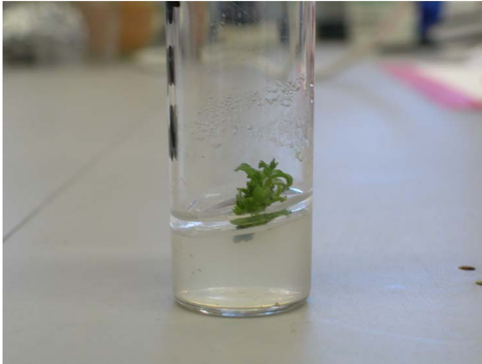
Fig. 7. Freycinet Wax Flower shooted explant.