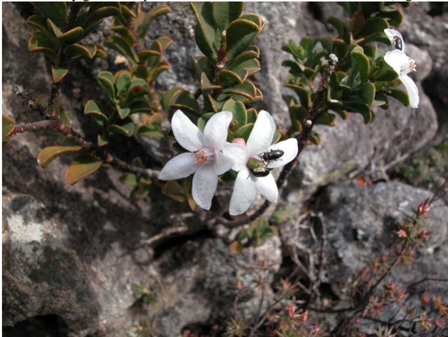
Fig. 4. Flowering specimen of the Freycinet Wax Flower. Two species of beetles and small flies were seen visiting flowers.

The limited observations suggested that the Freycinet Wax Flower was slow growing in the wild. General observations also suggest that the plant has an extended flowering period. The plants were visited by generalist pollinators such as beetles and small flies (Fig. 4).