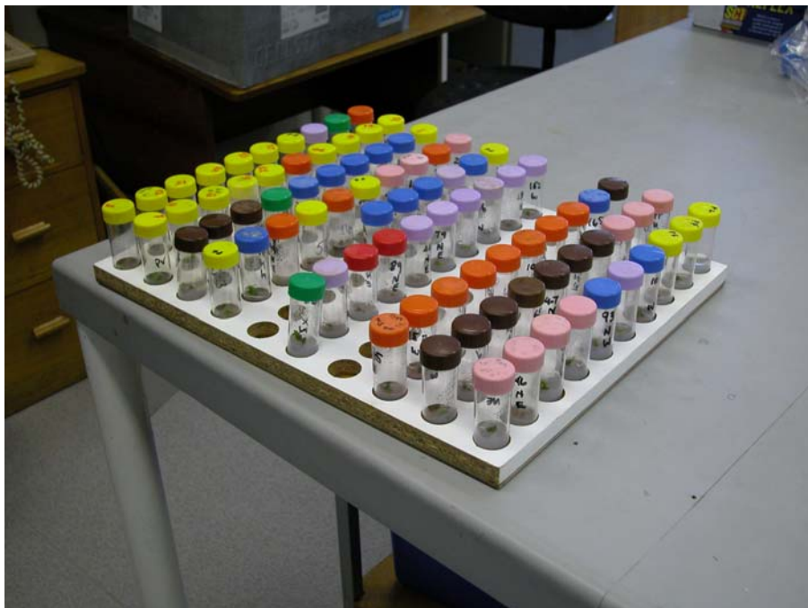
Fig. 6. Tissue culturing of the Freycinet Wax Flower using various media.

In this trial, a standard MS culture medium was used (Table 2) but with differing concentrations of hormones and auxins (Table 3, Fig. 6). Eight treatments were used, with one control, the variables being the concentration of NAA, IAA and BAP, keeping the medium at a uniform pH of 5.8. This experiment, begun in early December 2002, used 180 explants, with a standard light/dark regime at a controlled temperature. Due to the nature of some of the collected material, a fairly high loss rate was anticipated, and to some extent this occurred, with death and contamination affecting some 60% of the cultures.