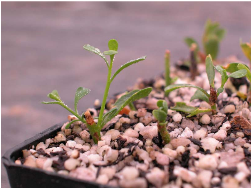
Fig. 5. Cuttings of the Freycinet Wax Flower in standard RTBG native potting mix.

Less success was achieved with the hardwood cuttings, but this increased after wounding and treatment with the same rooting hormone (Fig. 5). Until rooting was established, all cutting material was initially held on a heat bed in conjunction with a misting system.