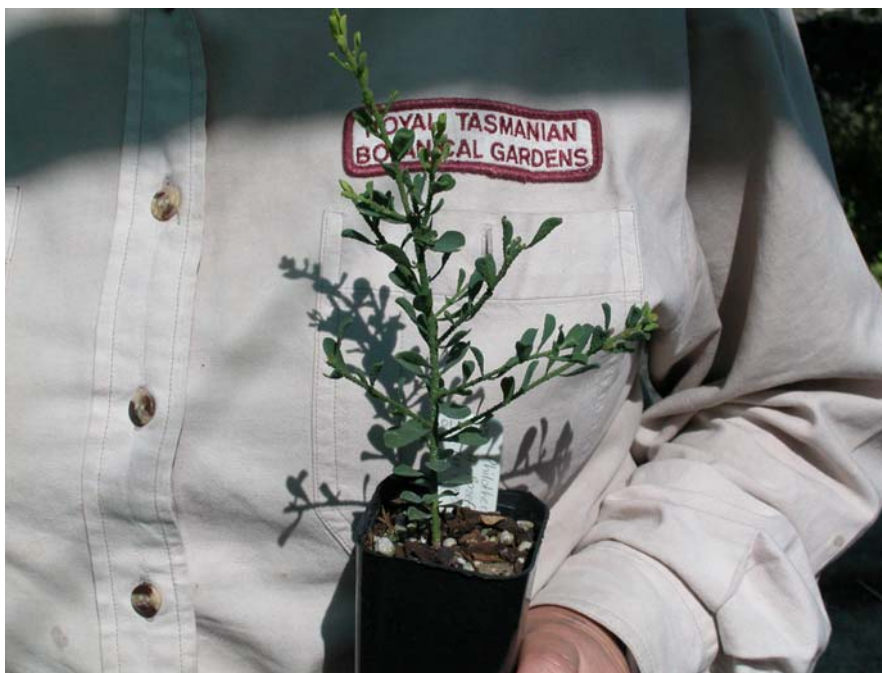
Fig. 8. One of the successful cutting-produced plants.

From the results of the various propagation methods that have been trialled thus far it is clear that from a practical point of view standard nursery vegetative propagation methods are the most effective. Currently the RTBG holds 70 cutting-produced plants in pots (Fig. 8). A limited number have been planted out in a garden bed at the RTBG but they are not thriving probably due to inappropriate edaphic conditions. They are planted in a dolerite clay but their natural habitat is an open granite sand or in drip cracks in the rock.